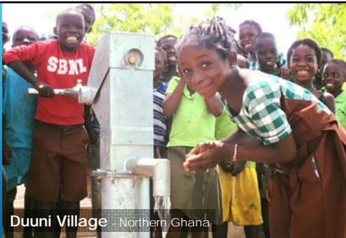
Duuni Village Northern Ghana

Ghana West Africa Missions | Searcy, AR | gwam.org | lmchworter@gwam.org | 256-566-9220