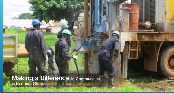
Making a Difference in Communities in Northern Ghana

Ghana West Africa Missions | Searcy, AR | gwam.org | lmchworter@gwam.org | 256-566-9220