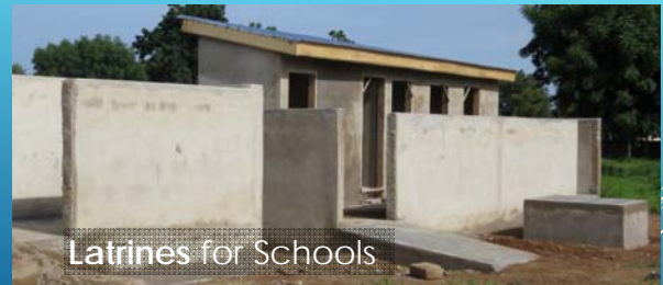
Latrines for Schools

Ghana West Africa Missions | Searcy, AR | gwam.org | lmchworter@gwam.org | 256-566-9220