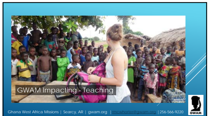
GWAM Impacting - Teaching

Ghana West Africa Missions | Searcy, AR | gwam.org | rmcwhorter@gwam.org | 256-566-9220